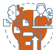
DIGITAL MENTORSHIP LEVERAGE PROGRAMME

For more details on my courses and mentorship programmes Visit www.thedigitalmentor.ie