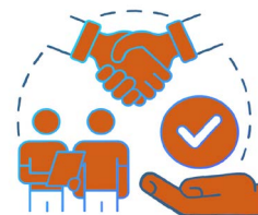
DIGITAL MENTORSHIP ELEVATION FOCUS