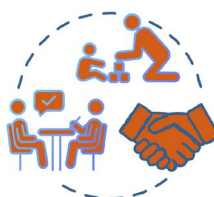
DIGITAL MENTORSHIP ONE TO ONE COACHING